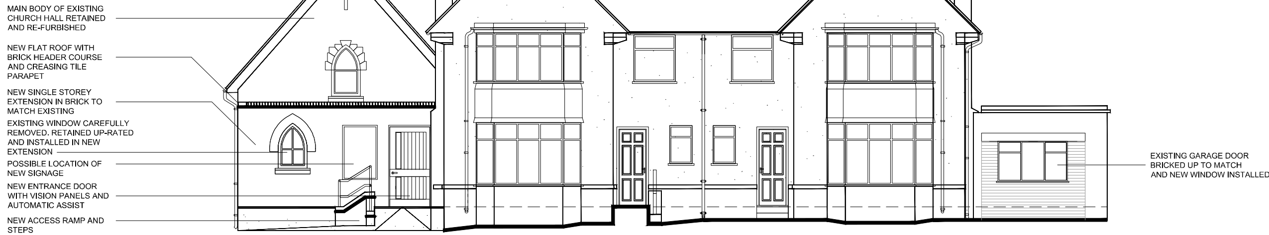
1 PROPOSED SOUTH ELEVATION Scale: 1:100