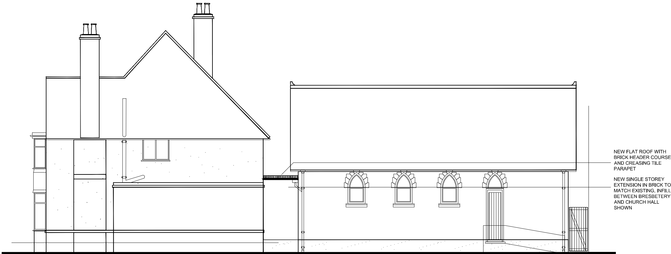
2 PROPOSED EAST ELEVATION Scale: 1:100