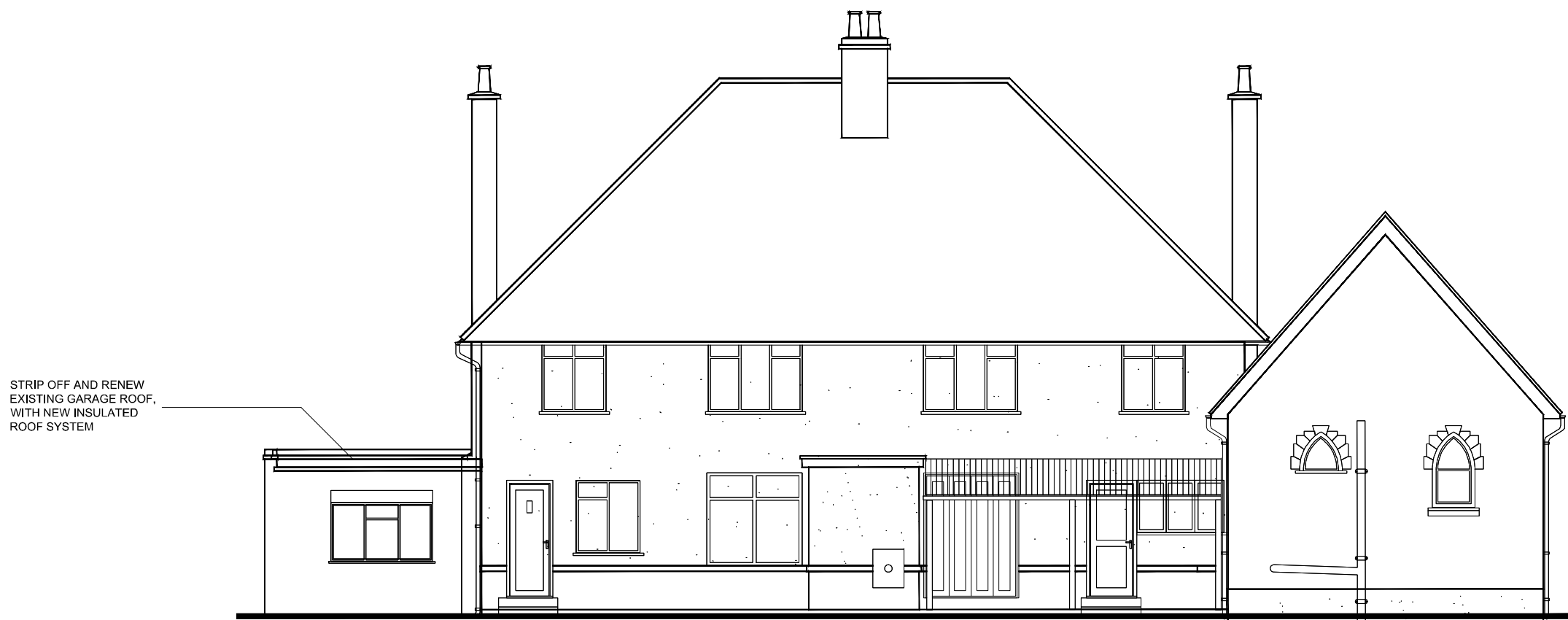
3 PROPOSED NORTH ELEVATION Scale: 1:100